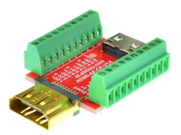
Figure 3: HDMI-AF-CF-V1A with headers